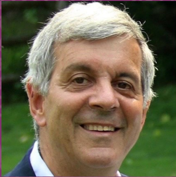
Dr. David Helfgott