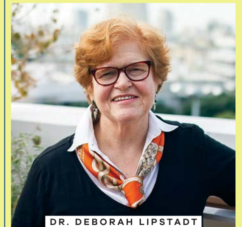
DR. DEBORAH LIPSTADT