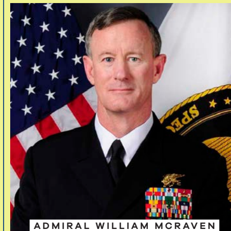
ADMIRAL WILLIAM MCRAVEN